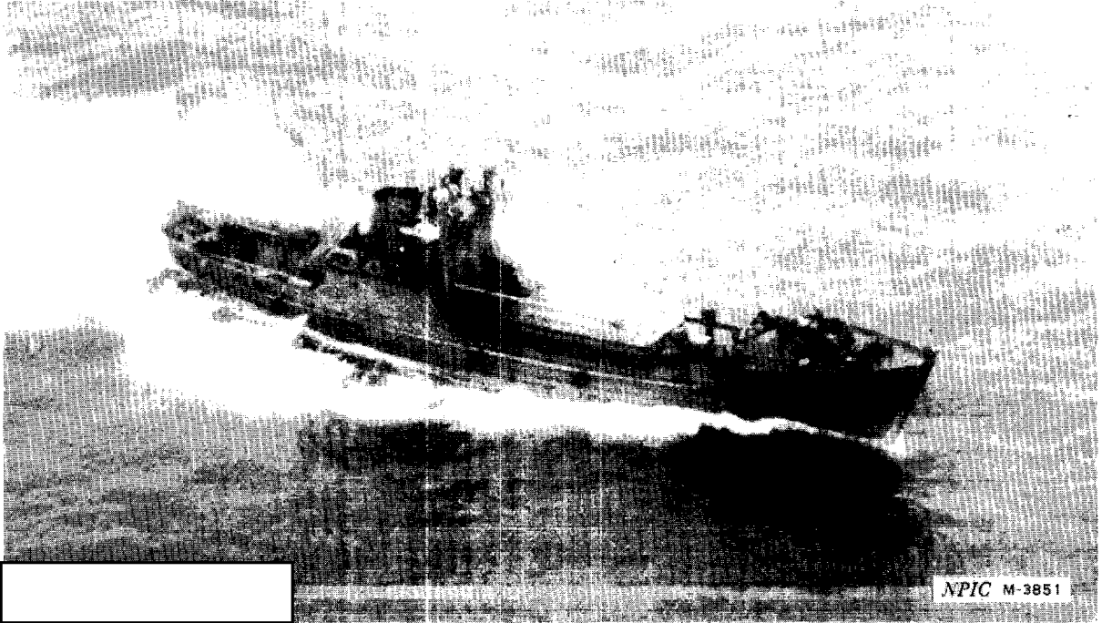
FIGURE 2. SL-1 IN TONKIN GULF